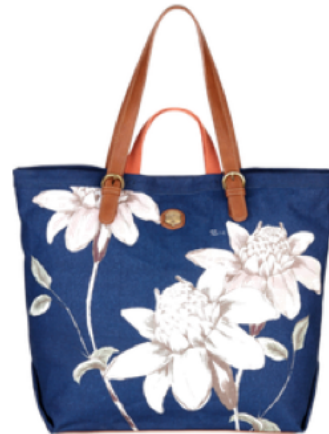
Nica Sheila Tote Bag , Denim Flower Print

Pioneers , who express their Wood energy whenever they wear jeans, might choose a practical tote with a floral pattern.