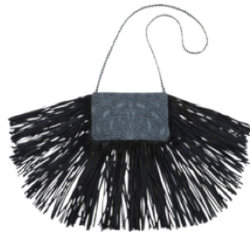
BARBARA BONNER Ginger Easy Damask Denim Shoulder Bag

Philosophers , who express their Water energy whenever they wear something creative, might choose a handbag in a dark jeans color with fringes all around it.